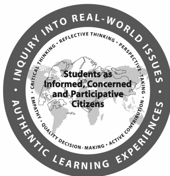
Figure 1.1 The Singapore Social Studies Curriculum

Figure 1.1 reflects the philosophy underpinning the Singapore Social Studies curriculum.